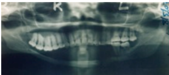
Figure 2 Orthopantomograph of the mandible taken six years post operative. Note the completely regenerated bone.

At 18, six years after her operation, she reappeared to request for a partial denture to replace her missing teeth. The mandible, at that time, appeared completely regenerated following a review of a radiograph, (Figure 2), taken to assess her for the construction of the partial denture (Figure 3).