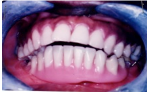
Figure 3 Photograph of patient showing close-up view of partial denture fitted in place

It was evident then that the patient's facial development was consistent with her age. Thirteen years after her treatment despite the weight carried on the regenerated bone, from the use of the denture, there is no evidence of bone resorption, and the shape of the mandible is satisfactory with no evidence of recurrence. (Figure 4)